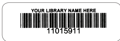
Shown above: Single