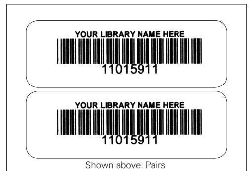
Shown above: Pairs

Questions? Please contact our Customer Service Department